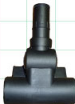
Turbo Carpet Brush

For additional accessories that may be compatible with your F5 Automatic, Please visit us at www.vaporlux.com