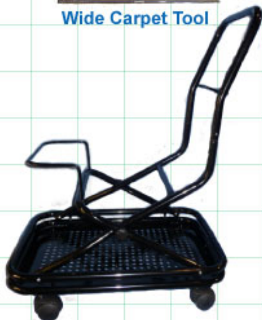
Cart w/ Accessory Tray