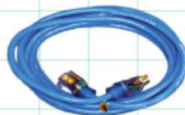
Heavy Duty 25' Extension Cord