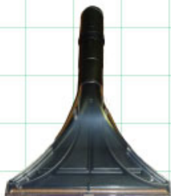
Wide Carpet Tool