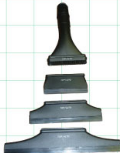
Window Cleaning Kit